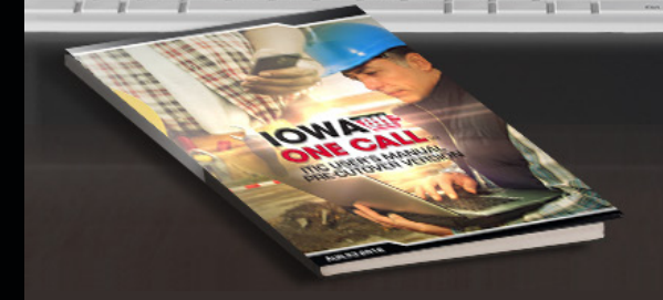
Use the right tool for the job – ITIC NextGen offers a diverse array of mapping options to fit every scenario.